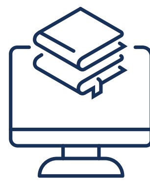
INDIVIDUAL TRAINING PLAN