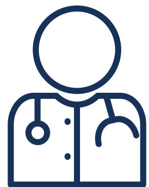
HEALTH CARE PACKAGE